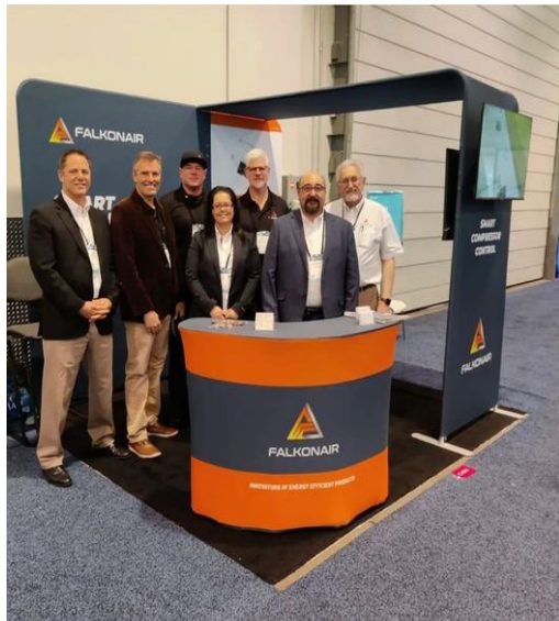
Some of the Falkonair Team

Thank you to everyone that stopped by to visit our stand and meet us at the AHR Show in Las Vegas, NV, US in February. It was fantastic to see so many familiar faces and meet new people too.