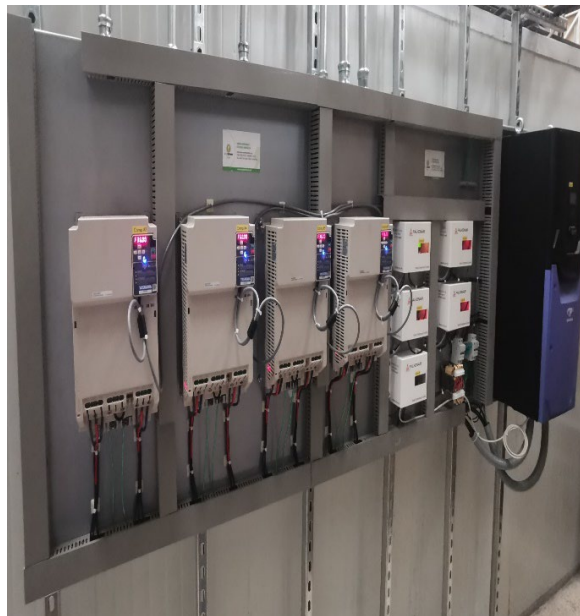
Invertek VFD'S with SCC'S