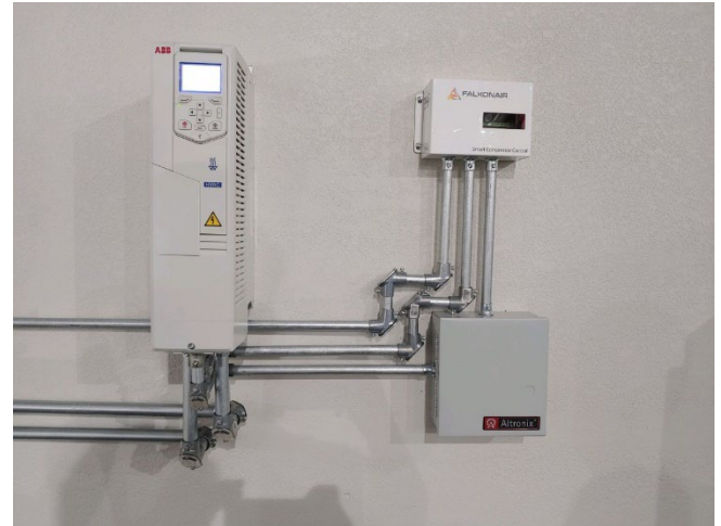
ABB VFD with SCC at Roessler

Falkonair were invited to take part in their recent successful open house event.