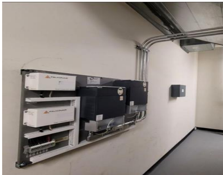
The Schneider Dual VFD Panel

Inland Mechanical Services completed a 12-compressor installation using Falkonair's Smart Compressor Control's connected to Schneider Electric ATV212's on a large office REIT in San Diego, California. So far, the customer is seeing savings of over 30%, this will be continually monitored, and the case study will follow in our next newsletter.