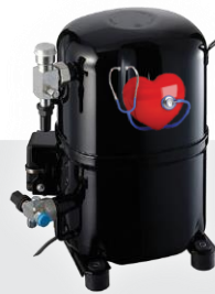
Compressor Temperature sensor to protect your compressor

Gain 20-30% energy efficiency on commercial RTU's & refrigeration systems